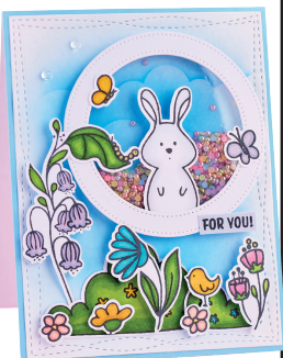
Next Level Shaker Cards