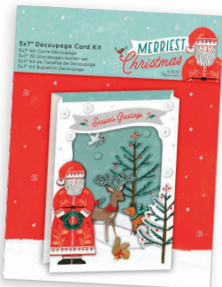
On test Cardmaking Kits