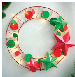
On test DIY Wreaths